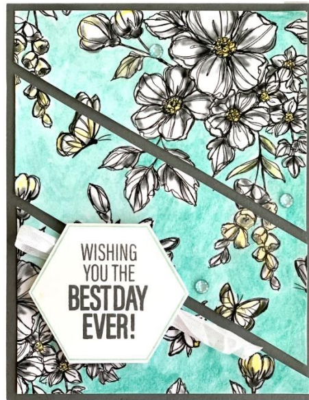
Alternate Version with Watercolor Pencils