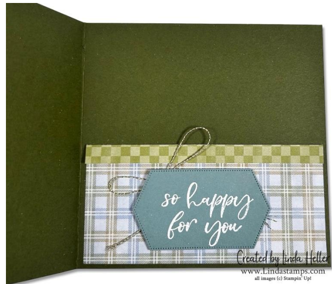
Gift Card pocket

Stamp Sets: Linked Together (sentiments)